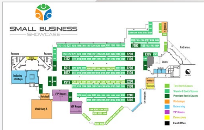
Interactive Map at TulsaShowcase.ExpoFp.com

Call us for special needs on booth space.